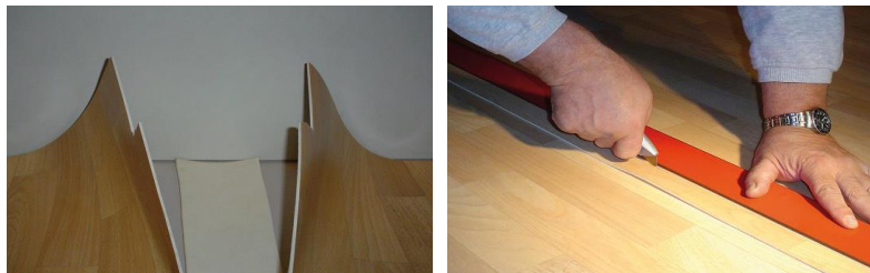
Scrap piece placed under the seam - double cut with a straight edge